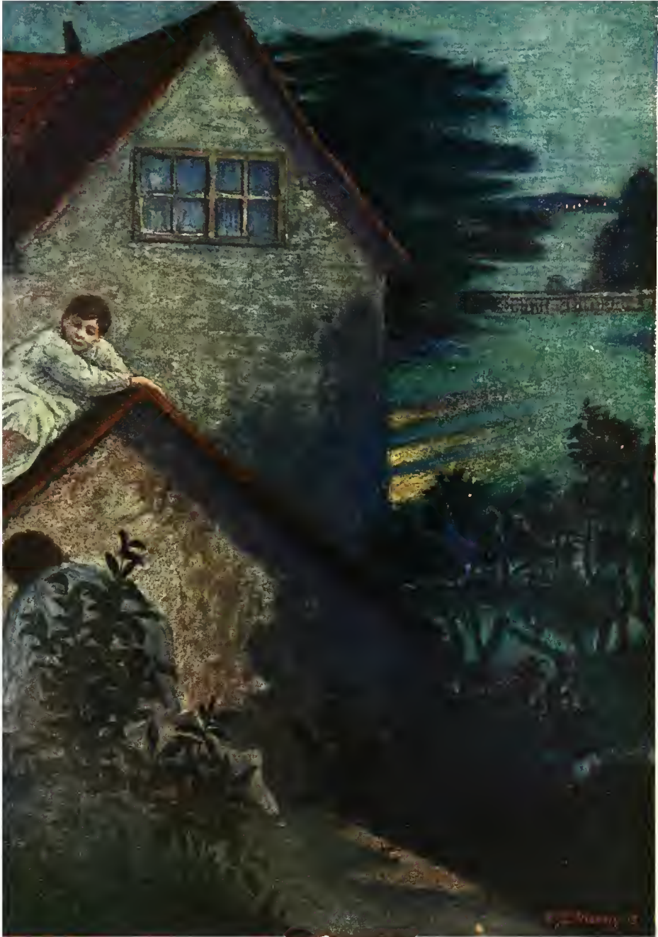
"THIS OVERLAND ROUTE HAD BEEN REVEALED TO US ONE DAY BY THE DOMESTIC CAT, WHEN HARD PRESSED IN THE COURSE OF AN OTTER-HUNT"